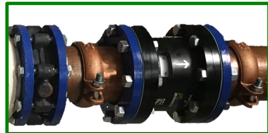
6" Smart Water Valve Installed at Houston Hospital

How it Works: The valve modulates the speed of the pressure drop in the water as the clay valve opens and fills the domestic house tank. The meter's cavitation is much less with the Smart Water Valve - and that means less air is being read as water.